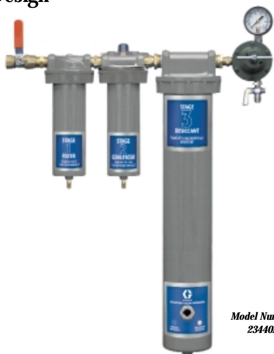
Model Number 234401